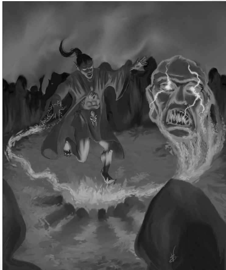
Rob the Reaper

Vorpal Strike: Your strike may sever an opponent's head. (Immediate)